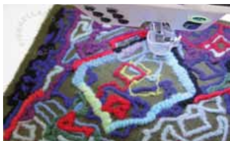
Add strength: Needle punch surface again.