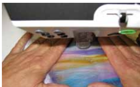
With or without stabilizer, hold flat to Needle punch WWW