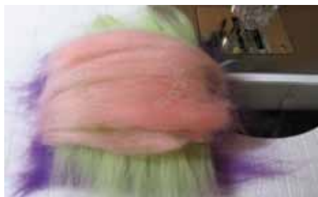
Top color travels to underside