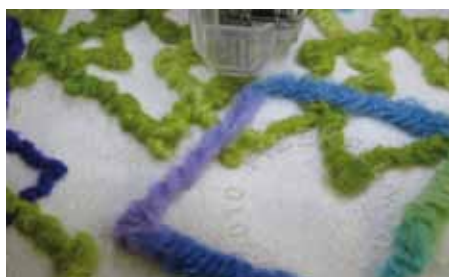
When design fills and thickens, eliminate hoop.