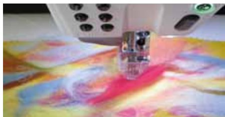
Color until your heart is content... avoiding thick applications