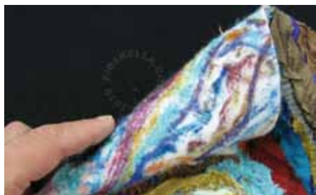
Color should show on underside.