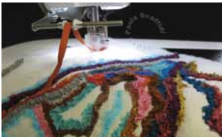
Add strength: Needle punch surface again.