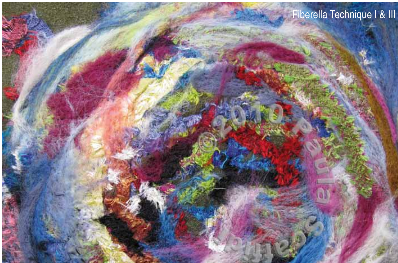
Technique I, snippet added, worked on a folded base.

Welcome to the amazing world of BERNINA Needle punch. Needle punch is an exciting way to create surface design, local embellishment and dramatic texture. You can also build felt fabric from fibers and create wash-able three dimensional ornaments. These are wonderful elements added to your sewing and embroidery projects; and fantastic as pure Needle punch.