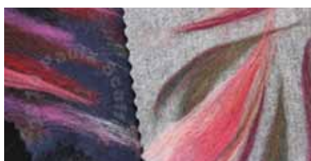
Fiberella Technique I Detail: Ode to Argyle