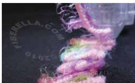
Two small yarns at once!