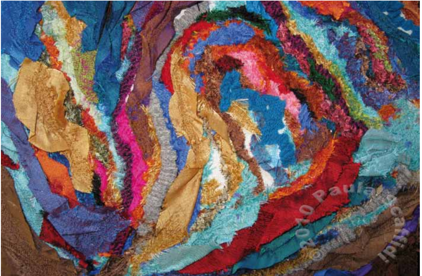
Create a rich field of texture for the fingertips.