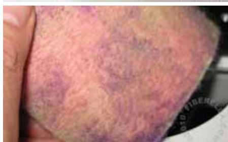
Reverse needle felting, was used to affect coloration.