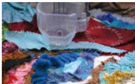
Reposition project for narrow or wide needle paths.