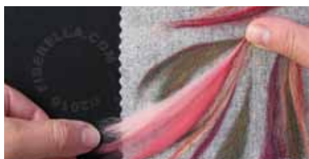
Twist the shingle tip. Leave interesting open-space shapes.